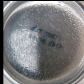
WITH THE SURECODE™