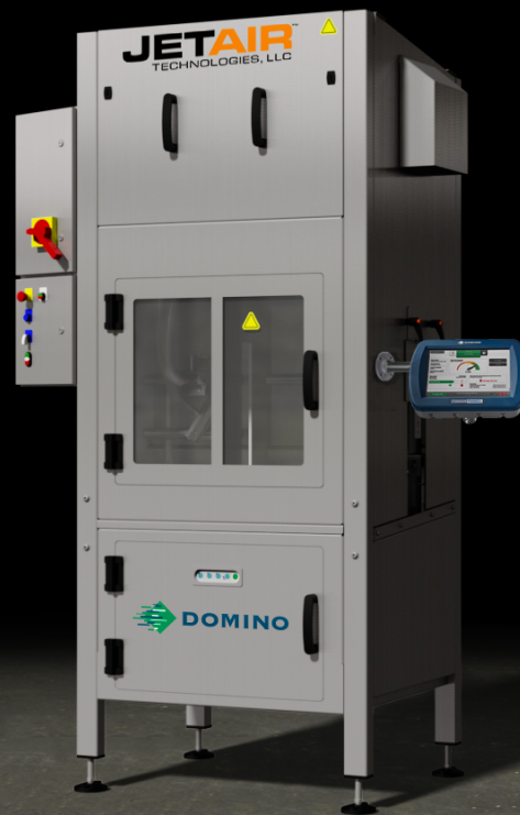
WITHOUT THE SURECODE™

The SureCode™ brings top-tier drying equipment together with state-of-the-art printing technology, ensuring your codes are pristine. Product flows through an integrated drying/blow-off chamber, removing any water and debris prior to printing for clear, legible, and reliable codes. Using JetAir's high-speed, high-efficiency blower and Domino's Ax-Series continuous inkjet technology, this system has built-in quality assurance. The SureCode™ is custom designed to handle the widest range of containers and line speeds up to 2,975 cpm. It easily integrates into existing packaging lines and all plant control networks. Standard and custom systems are available.